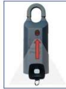
Infrared Keybox with fob