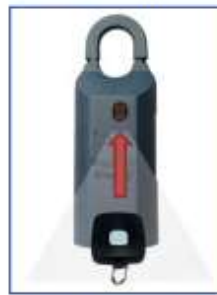
Infrared Keybox with fob