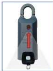
Infrared Keybox with fob