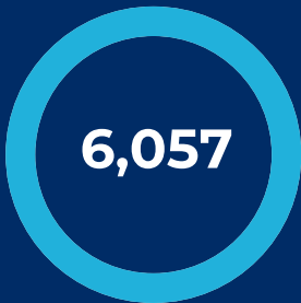
Total MLS Users

Our members are the heart of everything we do. During 2024, we focused on growing our community and strengthening member engagement through innovative programs, networking opportunities, and personalized support. Together, we've built a dynamic and connected membership that drives success.