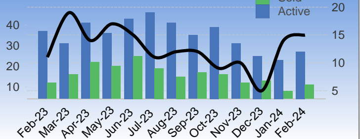
Monthly Market Activity